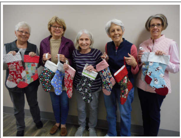
Sewing Sisters made 101 Christmas stockings this year for the ABCCM Christmas Angel program.