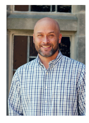
SPRING 2024 VOLUME 16, NO. 2