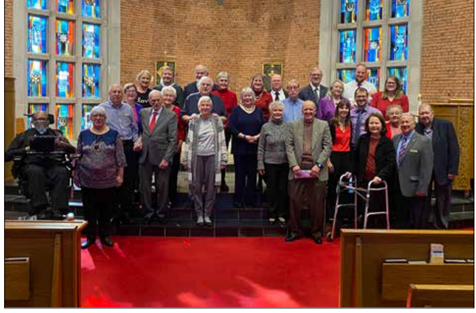
Couples celebrating in the annual Marriage Anniversary Service, Sunday, February 12, 2023