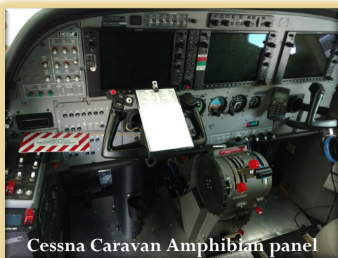
Cessna Caravan Amphibian panel

We are changing airplanes in some countries, but we are not changing the focus of MAF, and we are not changing the mission. Jesus Christ is central to MAF, and ours remains the same: Spreading the love of Jesus Christ through aviation and technology, so that isolated people may be physically and spiritually transformed. Different airplanes — Same mission.