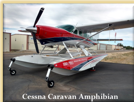
Cessna Caravan Amphibian