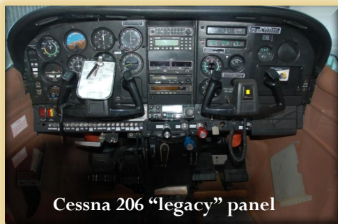
Cessna 206 “legacy” panel