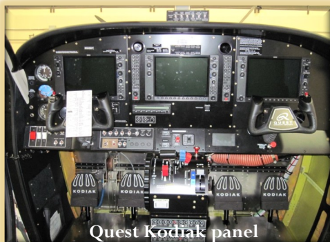
Quest Kodiak panel