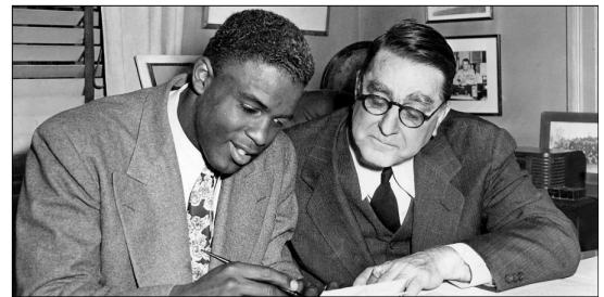
Jackie Robinson and Branch Rickey

Probably the biggest positive social change came in 1947 when Jackie Robinson became the first African American player in the Major Leagues. It's a story that has become well known. Branch Rickey, the general manager for the Brooklyn Dodgers, recruited Robinson, who was playing for the Kansas City Monarchs in a segregated baseball league. Robinson went on to be the Rookie of the Year in 1947, Most Valuable Player in 1949, and a Hall of Famer in 1962. It's significant that integration in baseball came a decade and a half before Dr. King and the civil rights movement of the 1960's. The part of this story that is usually omitted by the media is that Rickey and Robinson were both Christians. Again, God used His people to bring about positive change.