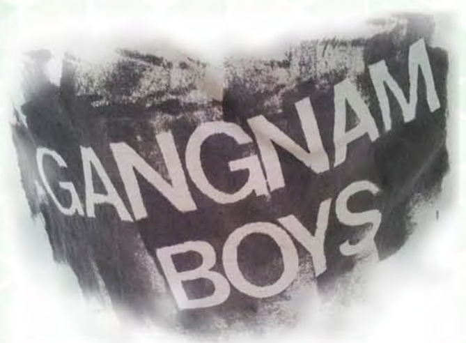
Loving the 'Gangnam Boys' at Gracehaven!

Through his testimony, we are reminded that God has commanded us to "be my witnesses in Jerusalem, and in all Judea and Samaria, and to the ends of the earth" (Acts 1:8) and to "share in suffering for the gospel by the power of God, who saved us and called us to a holy calling, not because of our works but because of his own purpose and grace, which he gave us in Christ Jesus ..." (2 Tim 1:8-9) [ESV]. Ω