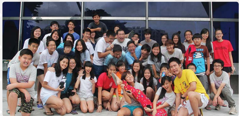
This year's camp had a larger number of younger participants – a sign that our Youth Ministry is growing! Pray that the youth will continue to maintain their bonds after this camp and grow together in fellowship with Christ.