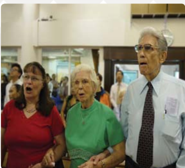
How wonderful when we worship God with all our hearts.