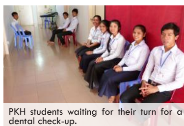
PKH students waiting for their turn for a dental check-up.