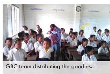
GBC team distributing the goodies.

During our last trip, we also brought some goodies such as biscuits, chocolates and wafers for a primary school in the rural Aoral district.