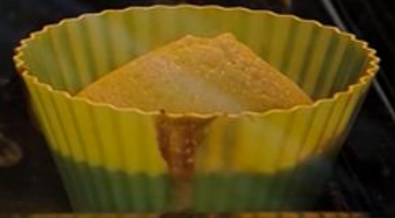
No baking powder