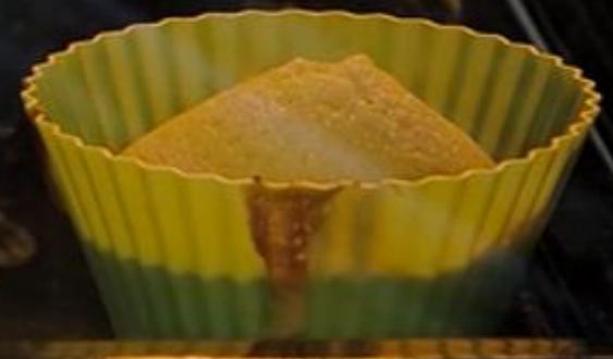
No baking powder