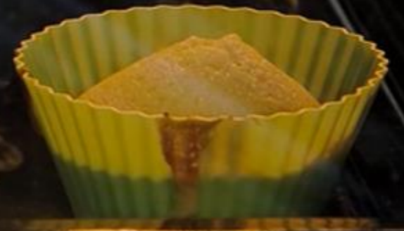
No baking powder