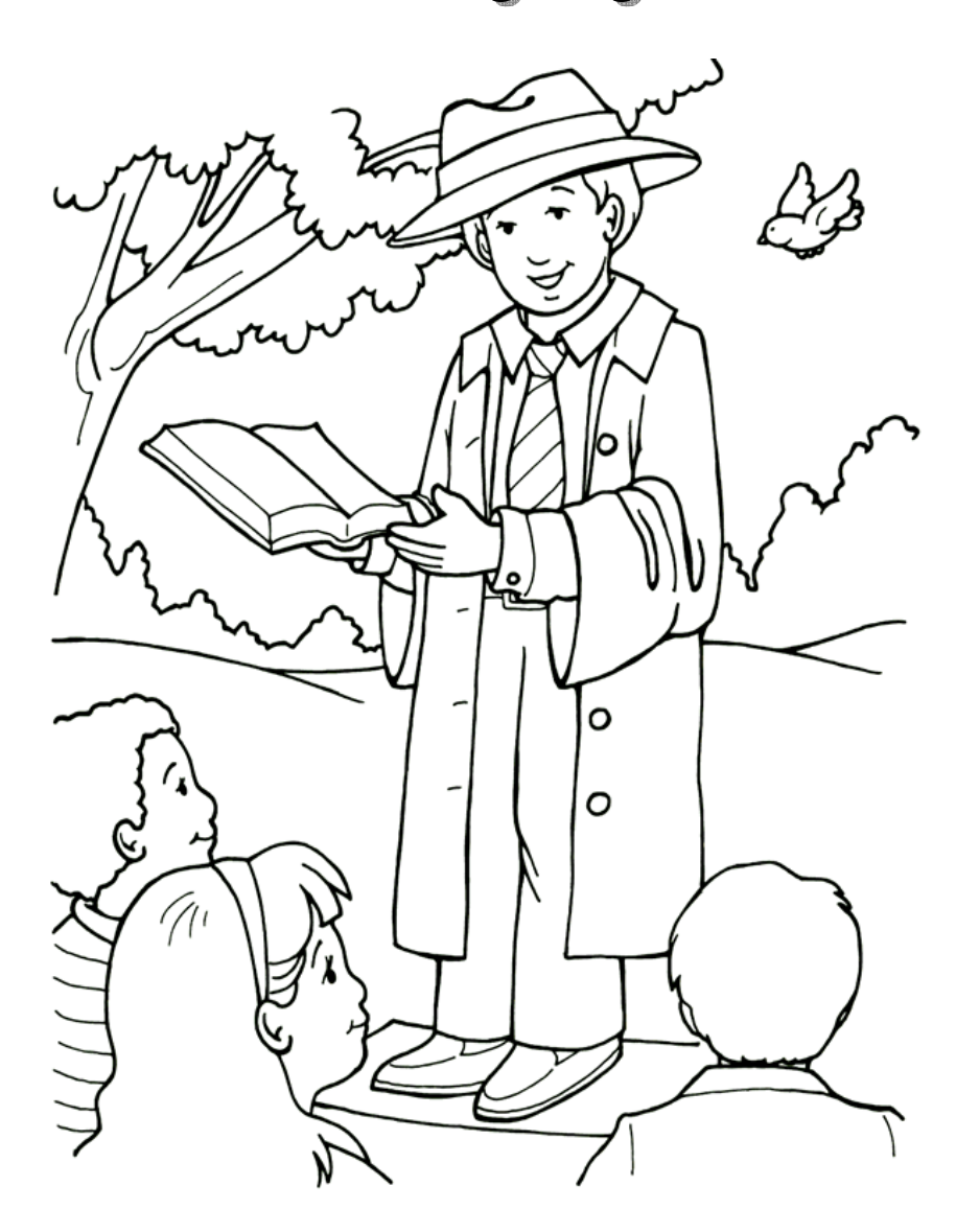
Inviting others to Jesus.

From Thru-the-Bible Coloring Pages for Ages 4-8. © 1986,1988 Standard Publishing. Used by permission. Reproducible Coloring Books may be purchased from Standard Publishing, www.standardpub.com, 1-800-543-1301.