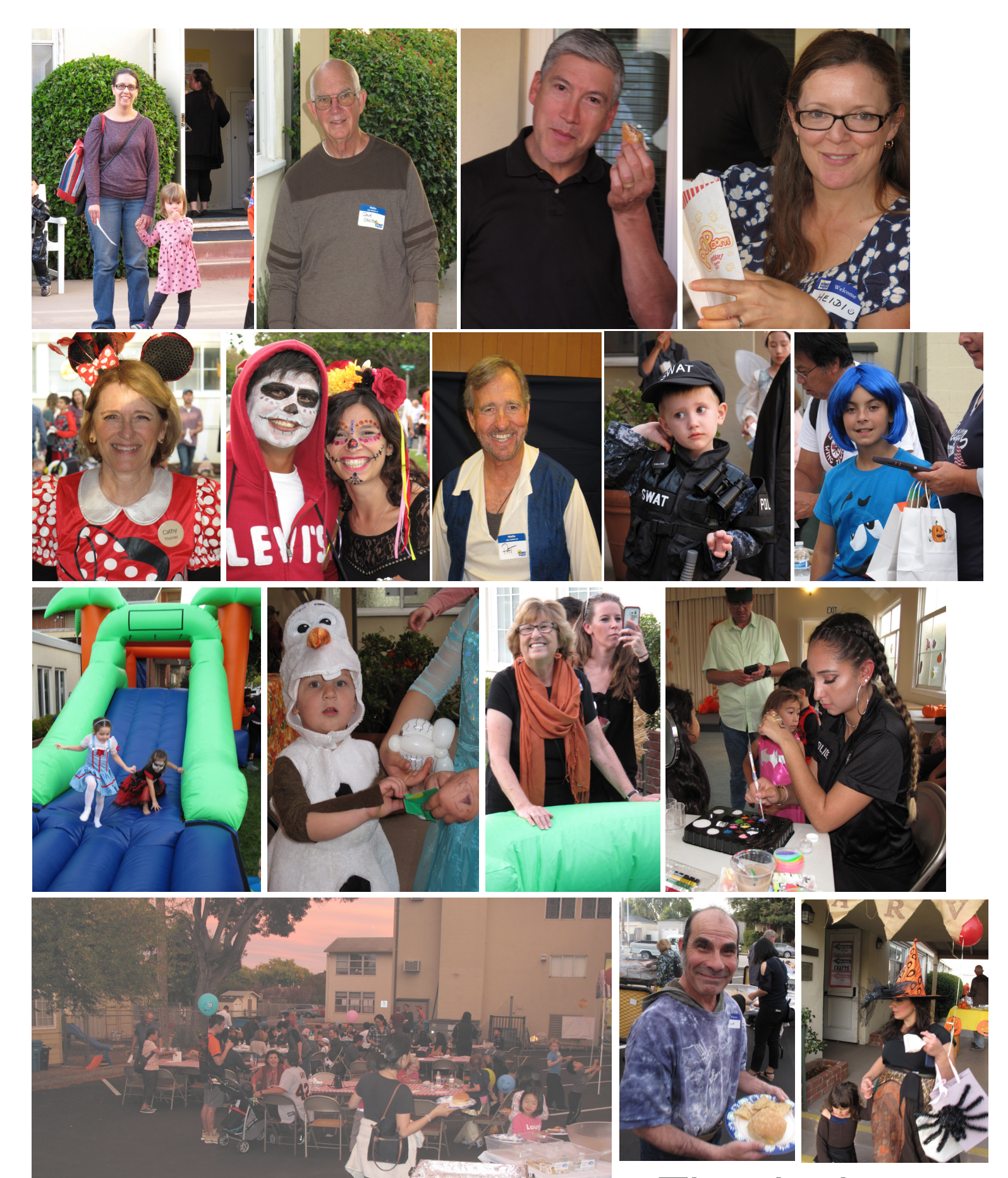
Thanks be to God!