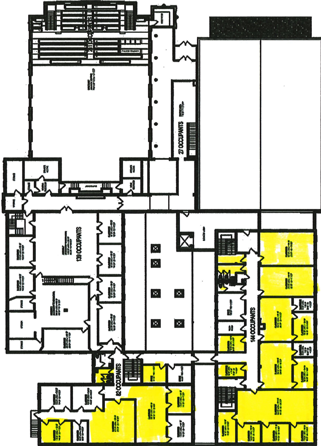
1 OVERALL SECOND FLOOR PLAN