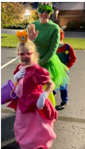
Trunk or Treat - Cont'd from cover