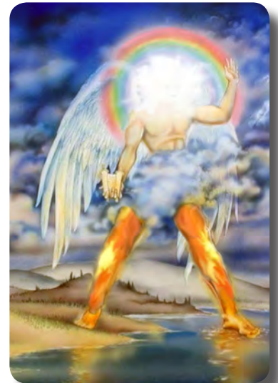
Revelation 10:1 Mighty Angel

of deity in the “Mighty Angel” that is coming robed in clouds with a rainbow over his head, with a face shining like the Sun, and His feet are like columns of fire described in Revelation 10:1. This Angel is a symbol of Christ in God coming in the authority of God Almighty to bring judgment. He wears a halo-rainbow crown! God does come in covenant love and mercy—His rainbow—but He also comes in judgment for those who love their pride and sin.