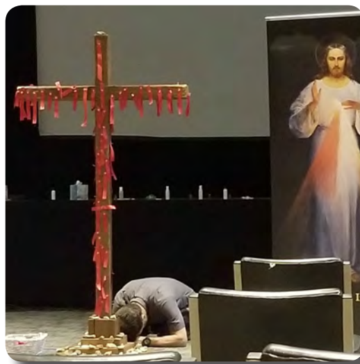
A soul receiving from Jesus at the foot of the Cross of Forgiveness

As with anything like this, the benefits and outcomes will unfold in the coming weeks and months. Pray for the five participants who experienced this training week. Pray that they would continue to grow in the grace and knowledge of our Lord, Jesus Christ (2 Peter 3:17-18); and, pray that they would be full of hope and believing, abounding in grace (Romans 15:13).