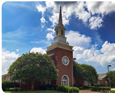
Lawndale Presbyterian Church

The next day we went to a church service at a Presbyterian Church. It was an eye-opener! It was such a different atmosphere. Everything was clean and white, very pristine and bright! I was delighted when one of the hymns we sang was "Fairest Lord Jesus." I love that hymn so much. It was a great day