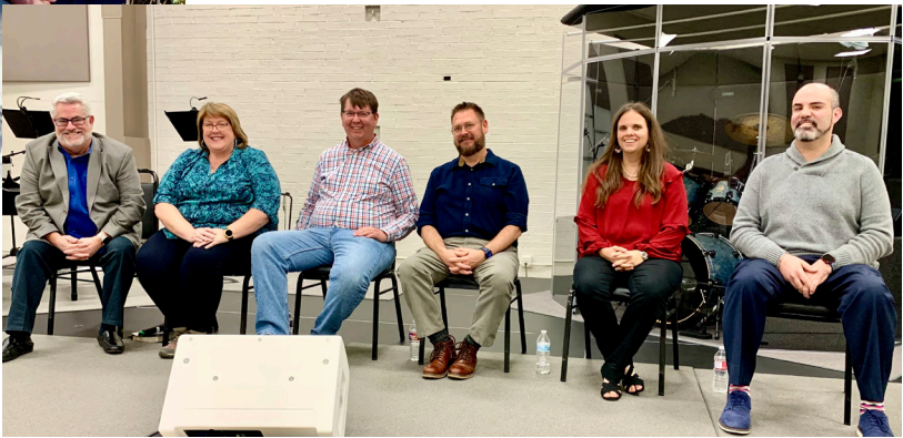
FSM Staff at IHI Screening Panel Discussion Trinity Baptist Church, Norman, OK