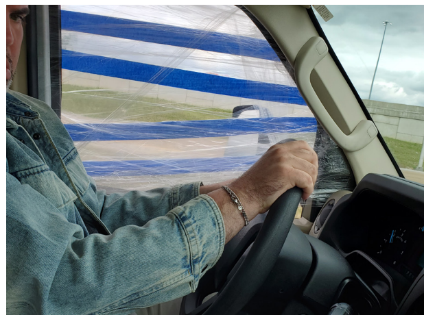
Busted window after being broken in by thieves. However, the Lord protected us! Traveling to Ohio