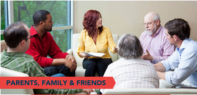
PARENTS, FAMILY & FRIENDS

MEETS 1ST & 3RD FRIDAYS APPLICATION REQUIRED