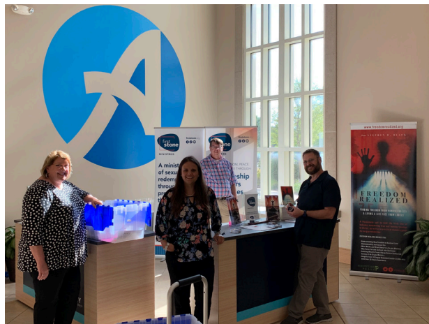
Staff setting up Information Booth, Asbury UMC, Tulsa, OK