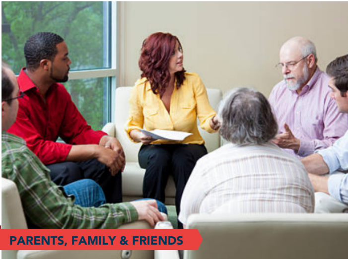
PARENTS, FAMILY & FRIENDS

MEETS 1ST & 3RD FRIDAYS APPLICATION REQUIRED