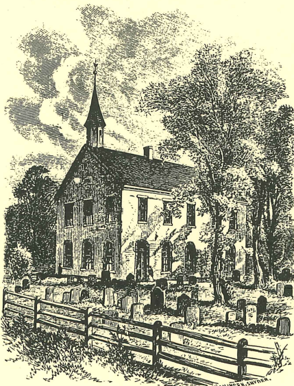
The Old Tennent Church

Mr. Tennent's prayer was answered, and he was revived in both body and spirit. He laboured as never before to, "Sound the trumpet of God's judgment and alarm the secure by the terrors of the Lord." He was a man literally consumed with a vision of the holiness of God. As a result he urgently warned the stubborn sinner and hypocrite of a final judgment and eternal hell.