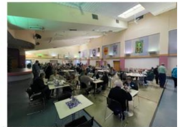
A great time of fellowship

Looking ahead, there are some exciting plans for Family Ministries, starting with an FPC Family Dinner in mid-late April.