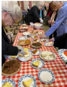
A plethora of pies to pick from