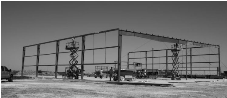
Celebrating ONE year in this new building!