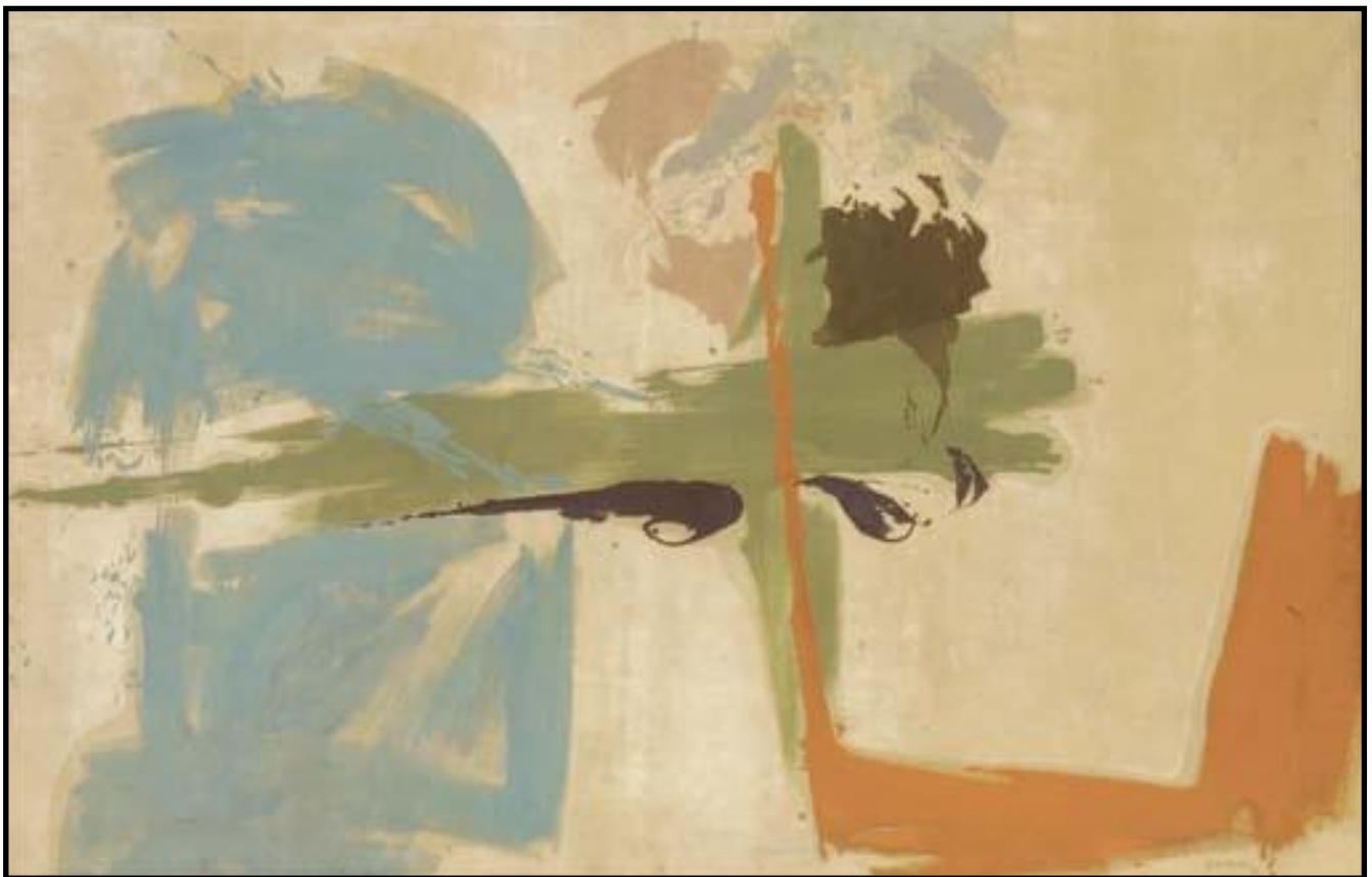
Friedel Dzubas - abstract