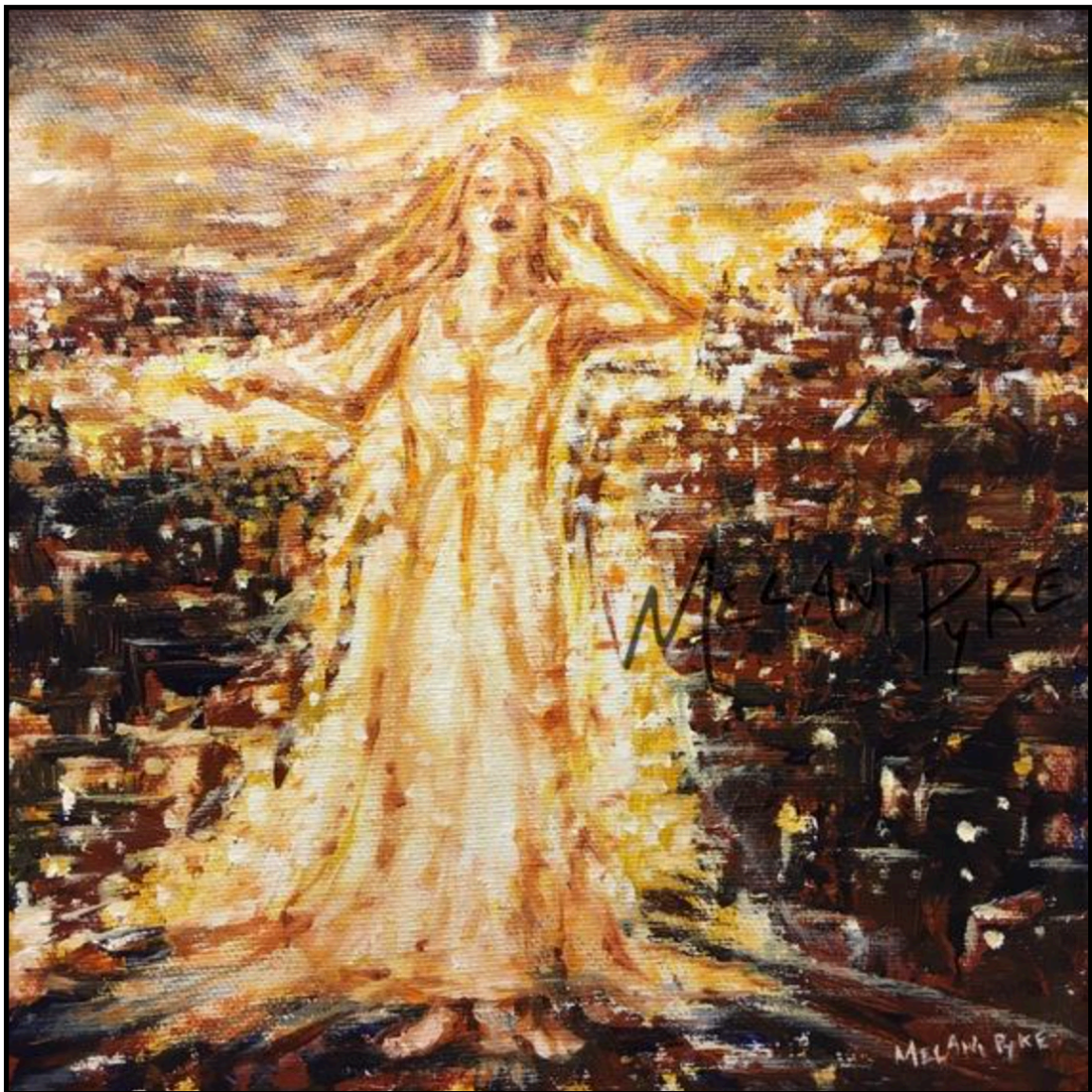
Oil painting on canvas by Melani Pyke