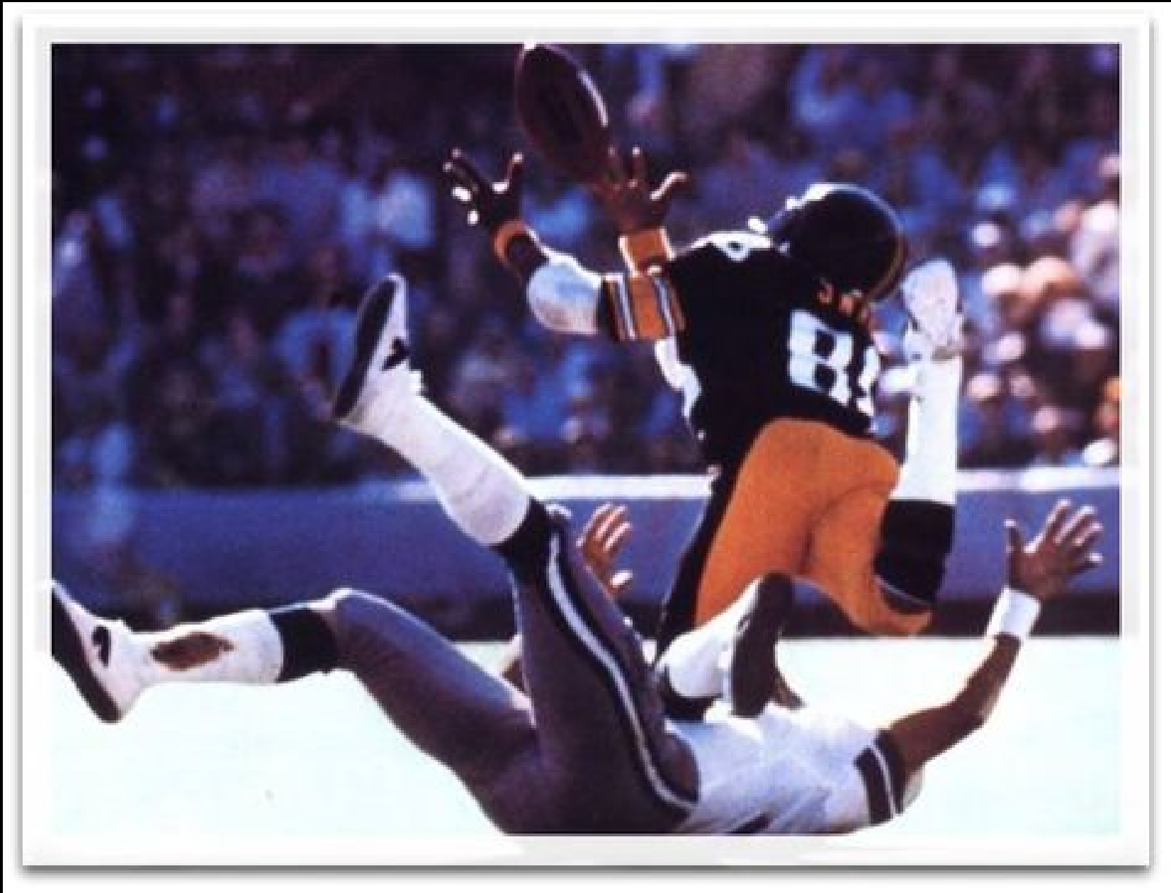
Hall of Famer Lynn Swann