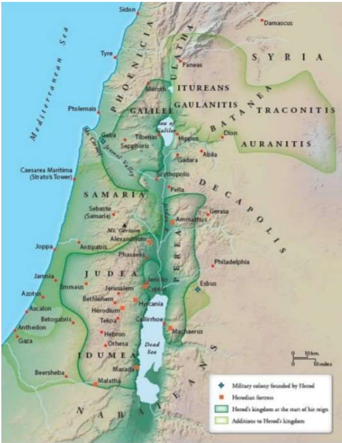
Palestine under Herod the Great