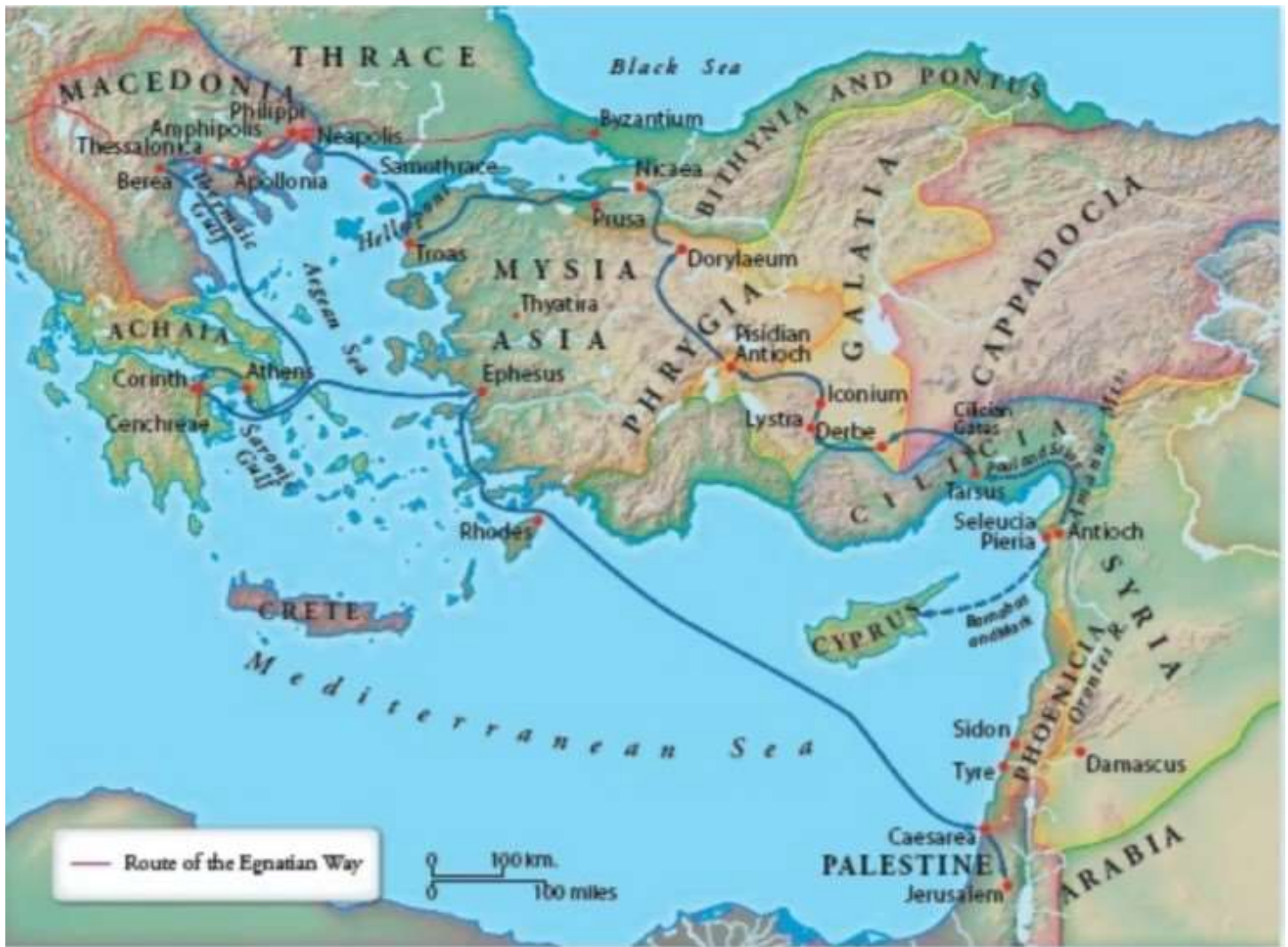
Paul's second missionary journey