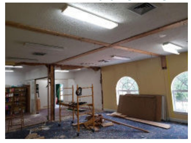
New floors coming soon!