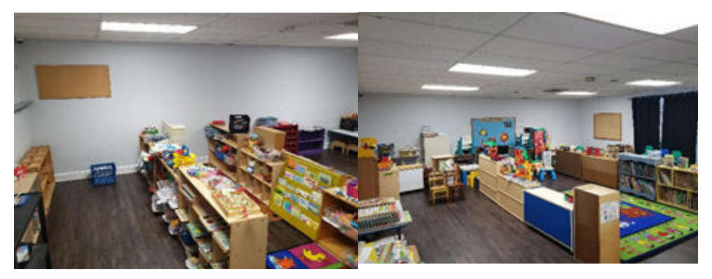
Your future Children's large group worship room!