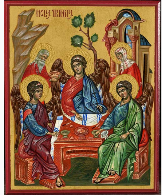
Iconography of the Holy Trinity | Legacy Icons

And we believe in the Holy Spirit, the Lord, the giver of life. He proceeds from the Father and the Son, and with the Father and the Son is worshiped and glorified. He spoke through the prophets. We believe in one holy catholic and apostolic church. We affirm one baptism for the forgiveness of sins. We look forward to the resurrection of the dead, and to life in the world to come. Amen.