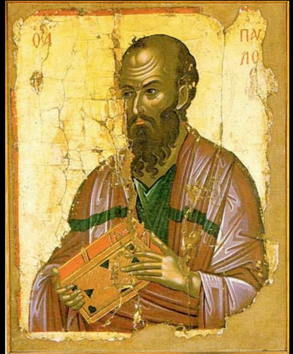
The Apostle Paul — Ephesians 2:13 —

But now in Christ Jesus you who once were far away have been brought near by the blood of Christ.