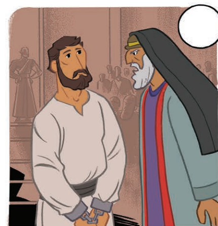
PILATE HANDED OVER JESUS TO THE CROWD TO BE CRUCIFIED.