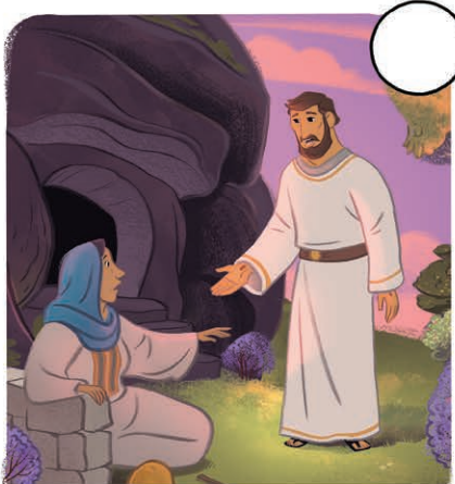
ON THE THIRD DAY, JESUS ROSE FROM THE DEAD.