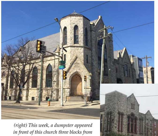
(right) This week, a dumpster appeared in front of this church three blocks from our house as a crew readies to build more apartments.

Within our neighborhood alone, at least five other church buildings have been renovated into living spaces. The same number have also been torn down.