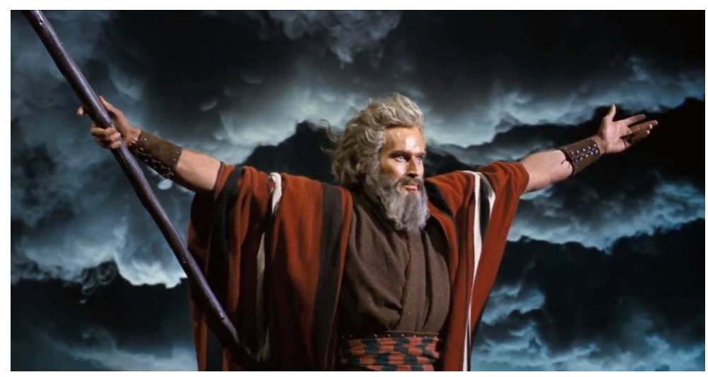
Moses Was Awesome!