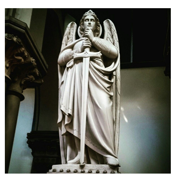
Angels Are Awesome!