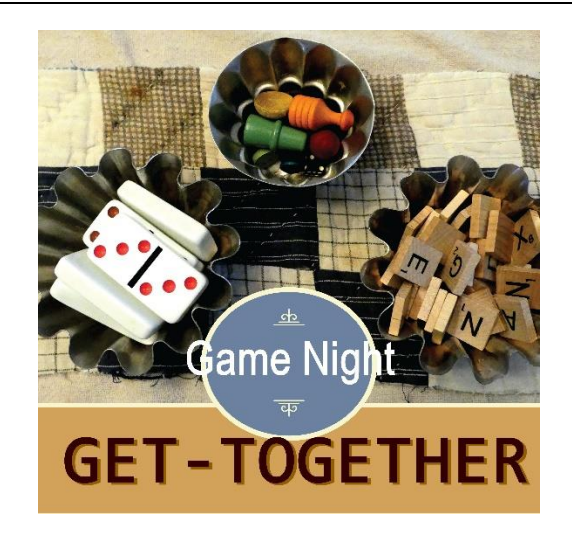
Friday, September 10<sup>th</sup> & 24<sup>th</sup>, 6:30 PM

Children are invited to come to movie night in the church's fellowship hall. You can bring your dinner with you. We will have a few snacks and drinks for you during the movie. Please sign up on the bulletin board outside of the church office if you plan to attend.