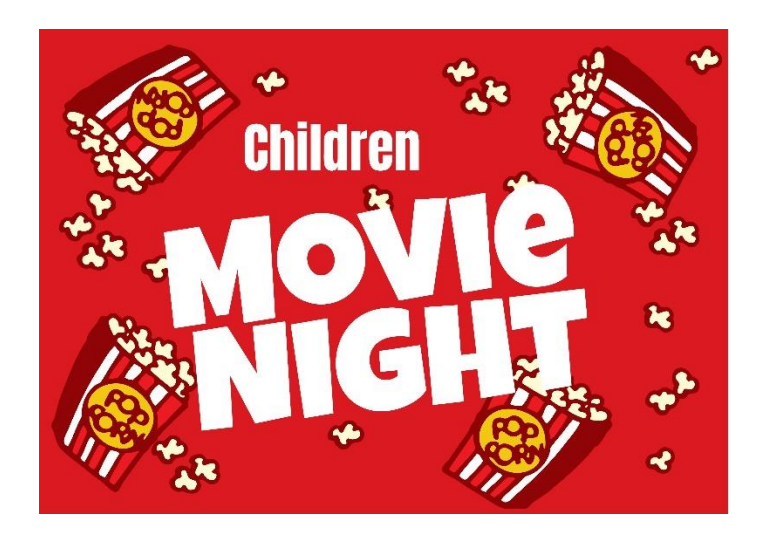
September 17 at 6:45 pm

Children are invited to come to movie night in the church's fellowship hall. You can bring your dinner with you. We will have a few snacks and drinks for you during the movie. Please sign up on the bulletin board outside of the church office if you plan to attend.