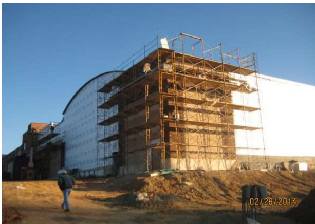
Southwest building corner