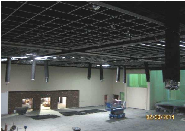
Ceiling grid installation in the gym