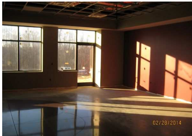
Media Center 112