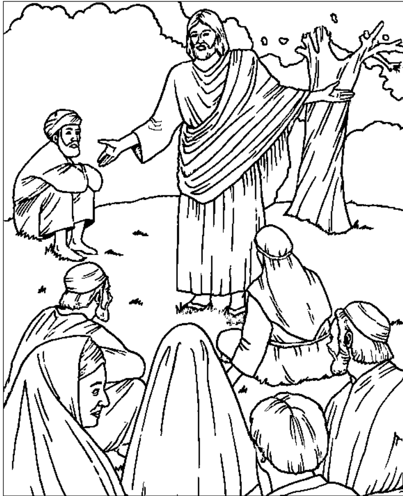
The Sermon on the Mount Matthew 5:1-12

From BibleStoryCard Learning System(tm) Coloring Book © 1996 Wesleyan Publishing House. Used by permission. Additional BibleStoryCard resources are available by calling 1-800-493-7539 or visiting online http://www.wesleyan.org/941/biblestorycards