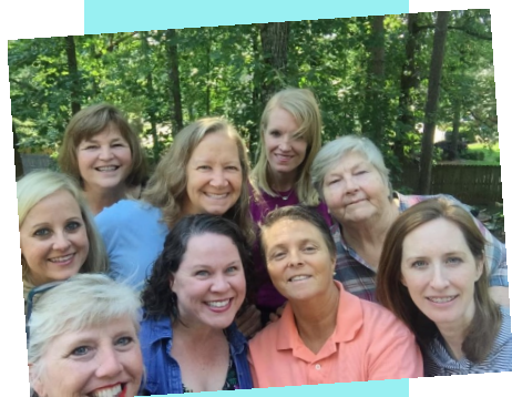
Nine of the 11 women leading the Ladies Leadership Conference in Kenya.

This faithful servant (who often refers to herself as a "cracked vessel") sees sharing God's love as a privilege. Her year is packed with travel, often to remote places with long days and crowds of people. Prayers for stamina, health, and grace are greatly appreciated.