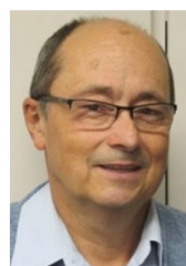
Glen Kuik Builders