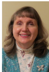
Nancy Lowe Welcome Centre