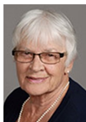
Patti Benallick Care Ministries