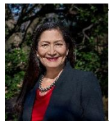
Deb Haarland U. S. Secretary of the Interior

Wed. 7p.m. – Women Meet every other week