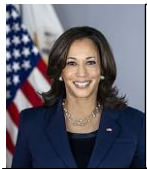
Kamala Harris Vice President of the United States Assumed office: January, 2021

Wed. 7p.m. – Women Meet every other week