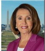
Nancy Pelosi Speaker of the House

Wed. 7p.m. – Women Meet every other week