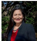
Deb Haarland U. S. Secretary of the Interior