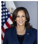
Kamala Harris Vice President of the United States Assumed office: January, 2021