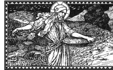
The Seed is the Word of God

The names of these Sundays may strike us as a bit odd: Septuagesima , Sexagesima , and Quinquagesima . To understand these Latin names, we must first understand that Ash Wednesday is Quadragesima . Quadragesima is the Latin number "fortieth". Ash Wednesday is the fortieth day before Easter (not counting Sundays). The great Forty Day Fast of Lent does not include the Sundays in the enumeration of days. Ash Wednesday falls this year on February 18.