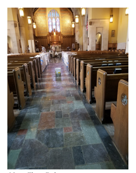
Nave Floor Before

I would especially like to thank our Board of Trustees for the recent work on the church front stairs, the church floor restoration, the move of the Altar Guild case to the Undercroft stairwell, and the many, many maintenance and repair projects that they accomplish each week that go unnoticed, in the school buildings, in the Rectory, in the Church, and on our campus grounds. I know that all our members join me in saying "Thank You!"