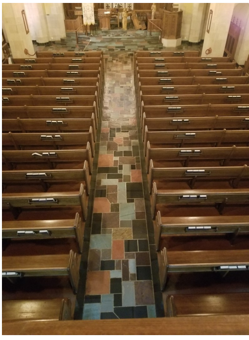
Nave Floor After